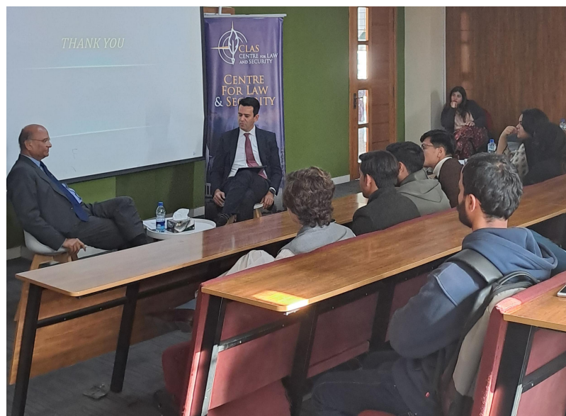
Interactive session at the end of the lecture